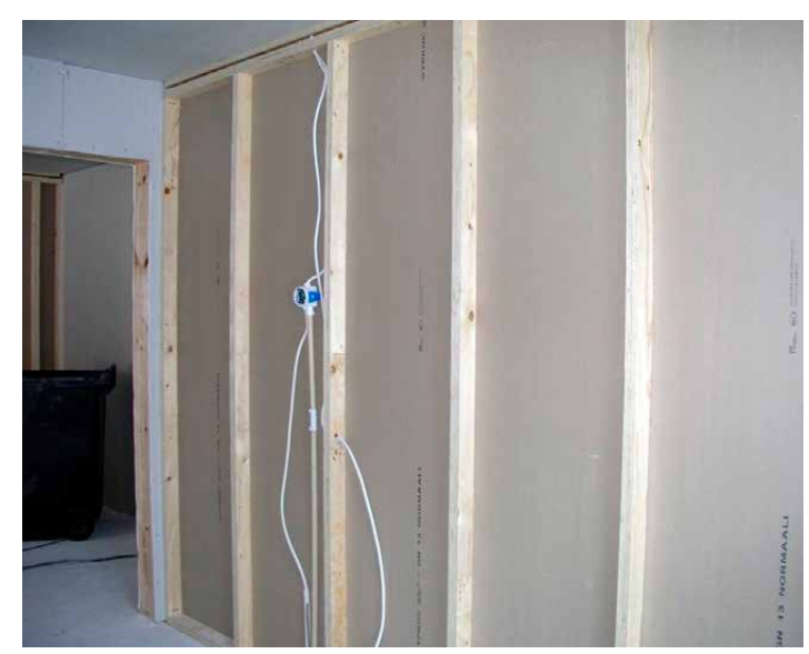
Figure 5. Kerto LVL studs in partition walls.

This document is property of Metsäliitto Cooperative (Metsä Wood) and is only applicable when used along with products produced by Metsä Wood. Use of the document for other manufacturer's product is prohibited. Metsäliitto Cooperative is not responsible for Metsä Wood and Kerto are registered trademarks of Metsäliitto Cooperative (Metsä Wood).