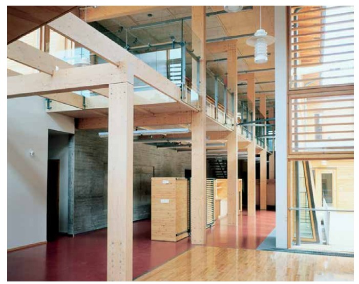
Figure 2. Kerto LVL columns in a beam and post structure.