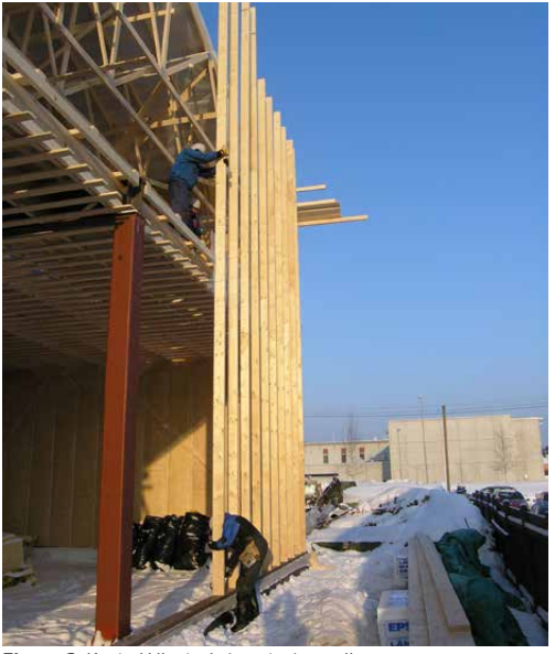
Figure 3. Kerto LVL studs in exterior walls