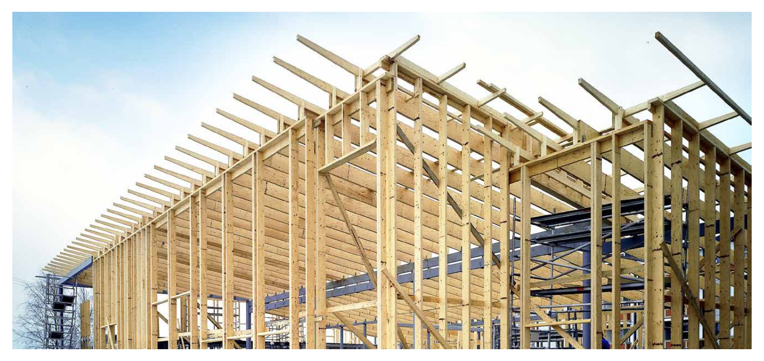
Figure 4. Kerto LVL as framework studs