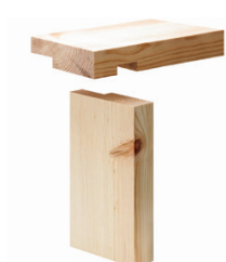
Above: Door casing sets