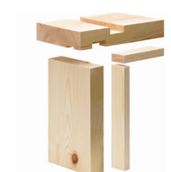
Above: Door lining sets