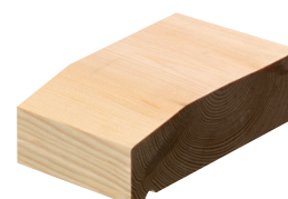
Above: Patio cill