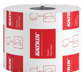
103424 Katrin Dispenser Toilet Paper Roll System 800 Sheets 2-Ply