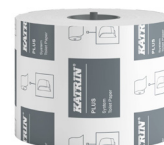
66940 Katrin Plus Dispenser Toilet Paper Roll System 800 Sheets 2-Ply

This leaflet is provided for information purposes only and no liability of any kind is accepted for potential errors or inaccuracies. Metsä Tissue reserves the right to alter its products, product information and product range without any notice.