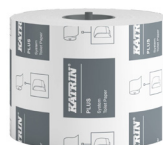
87365 Katrin Plus Dispenser Toilet Paper Roll System 684 Sheets 2-Ply