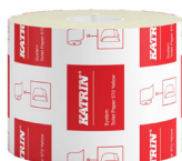
156104 Katrin Dispenser Toilet Paper Roll System 567 Sheets 2-Ply, Yellow

Selection from all countries. Please refer to web page for market-specific availability.