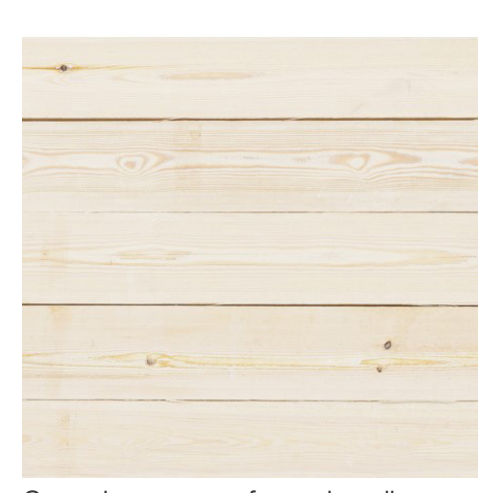
General appearance few and small number of knots. Only sound and dry knots allowed, limited size and number of knots.