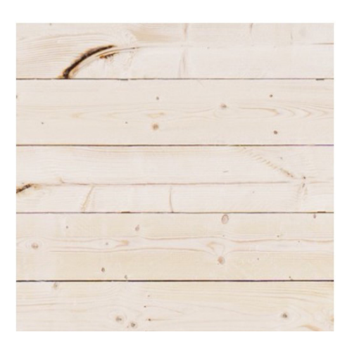
The size and amount of knots is not restricted.