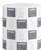
38015 Katrin Plus Dispenser Paper Towel Roll System M 3-Ply