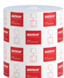
460263 Katrin Dispenser Paper Towel Roll System Medium 2-Ply, Blue