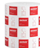
58198 Katrin Dispenser Paper Towel Roll System Medium 2-Ply