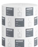
82537 Katrin Plus Dispenser Paper Towel Roll System