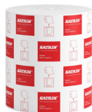
460102 Katrin Dispenser Paper Towel Roll System Medium 2-Ply