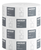
57795 Katrin Plus Dispenser Paper Towel Roll System Medium 2-Ply