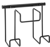
54961 Katrin Industrial Holder For Folded Wipes