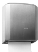
988366 Katrin Metal Dispenser Medium For Paper Hand Towels, Stainless Steel

Selection from all countries. Please refer to web page for market-specific availability.