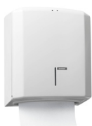
988113 Katrin Metal Dispenser Medium For Paper Hand Towels, White